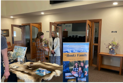
Sharing about AK at a church in SD