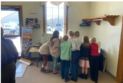
It is such a blessing when young people are interested in our display!