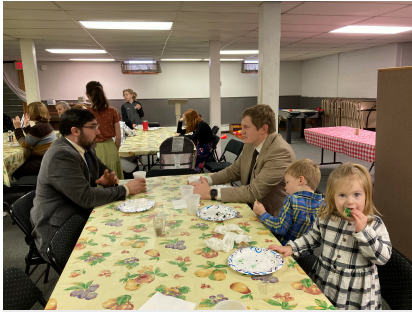
Fellowship with a supporting church in NY