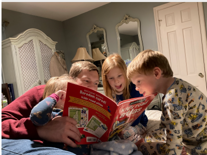
Studying where we've been in a kids' road atlas